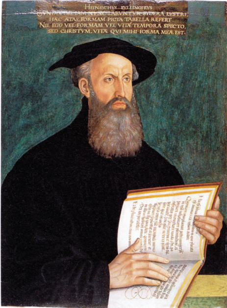
Heinrich Bullinger, 1504-1575

In Presbyterianism, church government is effected through a series of courts. This form of church government is a biblical method that emphasizes accountability between Christians. The first court of the church is called a “Session” and consists of all the ordained and installed Elders of a Congregation. The Session oversees and governs an individual church. The second court of the church is called a “Presbytery” and consists of all the Teaching Elders and two Ruling Elders from each Congregation within a specific geographical area. The Presbytery oversees the churches within her boundaries, supervises the training of Ministers, examines Ministers for ordination, and plants new churches. The third and final court of the church is the “General Assembly” which consists of Representatives from all Presbyteries and churches.