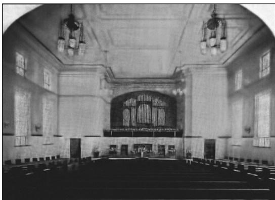
Sanctuary interior c. 1913