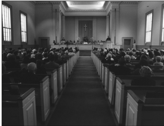
Reconstructed Sanctuary interior c. 1974