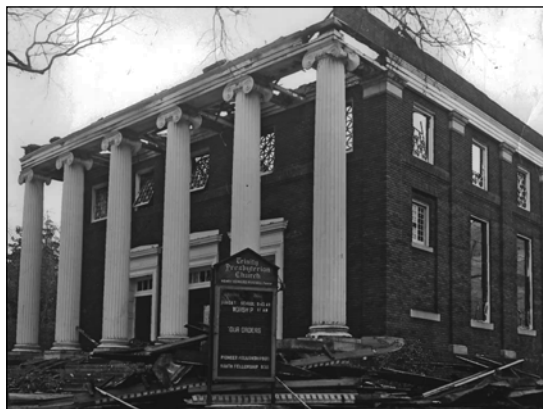
The morning after the fire, January 1951