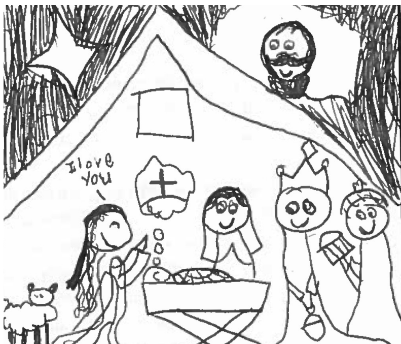
Garland Thomas, Age 7

6. Why is it wise to take your time making a decision? Why is it foolish to act too quickly without having thought through it? What can happen if you act too quickly?